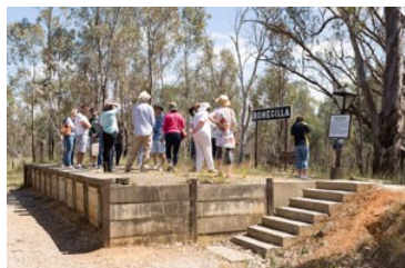
Bus tour participants exploring the former Bonegilla rail siding where many migrants first arrived on the "red rattlers" from Melbourne dock.

The follow on event from the reunion is planned for Saturday, November 2 and Sunday, November 3, 2019 and will be known as Discover Bonegilla 2019 .