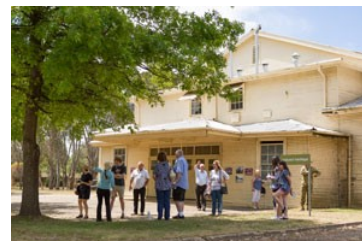
Bus tour participants at the former Bonegilla Migrant Reception and Training Centre Theatre which was one of the stop-offs during the tour.